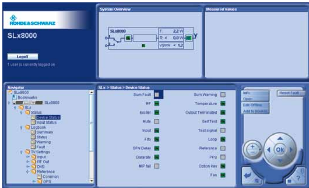
Convenient operation of the R&S®SLx8000 family of UHF/VHF transmitters via a web browser.

The output stages in the transmitters for digital standards are precorrected for all specified frequencies and power levels. After a change in frequency or power, the automatic set&go function loads the corresponding precorrection curve in the background. Manual precorrection is therefore not necessary when a transmitter is put into operation or a when a channel is changed. The available precorrection curves make it possible to reduce the power by as much as 10 dB below the rated power throughout the entire frequency range.